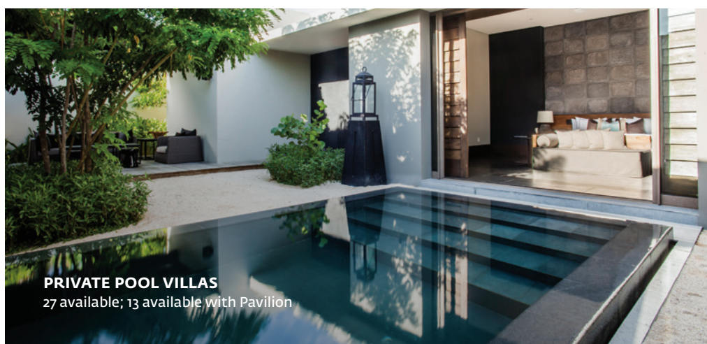
PRIVATE POOL VILLAS 27 available; 13 available with Pavilion