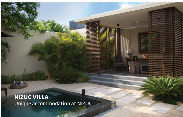
NIZUC VILLA Unique accommodation at NIZUC