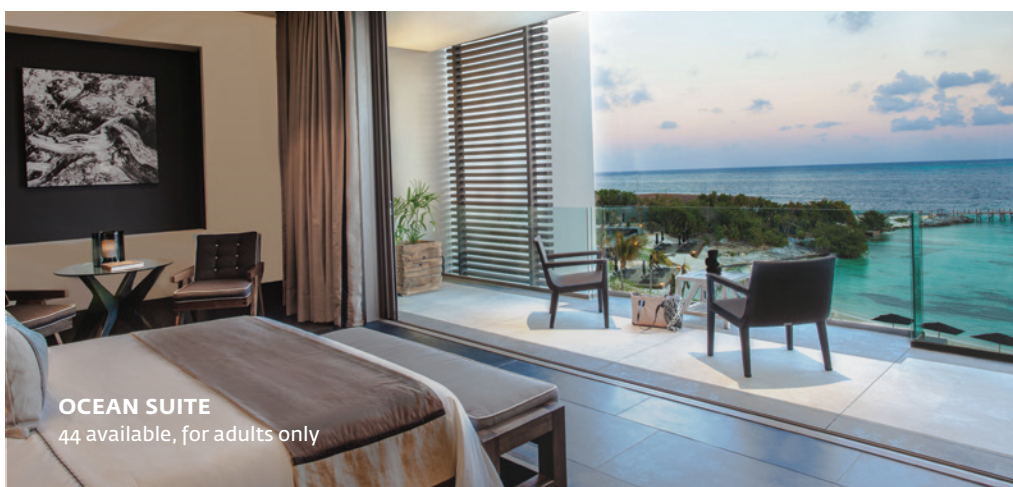
OCEAN SUITE 44 available, for adults only