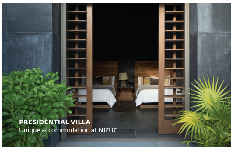
PRESIDENTIAL VILLA Unique accommodation at NIZUC