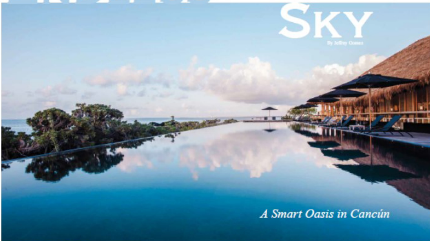
A Smart Oasis in Cancun