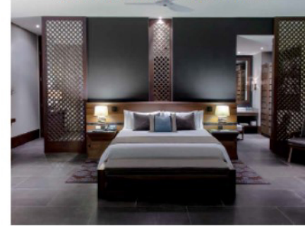
Below: A suite with modern touches at Nizuc Resort & Spa. Right: Flavorful and fun food at one of the property's 6 world class restaurants.

I've been to Cancun... several times. And it is always the same, just a packed tourist destination filled with little substance and a heap of commercialization. It's good revenue for the local economy and such great. But I'm selfish and I want something more when I visit. I've explored regions beyond the tourist traps. I've taken a rental car to Mirich, Chichén Itzá, Yulum and other towns. Now that's an adventurous stay. It's all the same. Nothing excites me to go back. The last time I went was for a wedding and it was fun and romantic (for the couple, not me). But Cancun always leaves me bored. There is something wanting to the place that I just can't put my finger on.